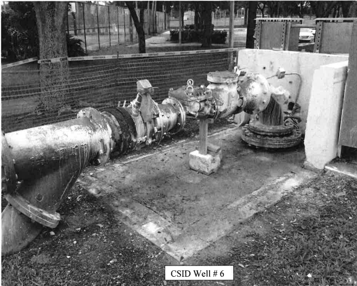
CSID Well # 6